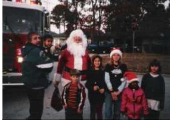
Do you recognize these neighborhood children? This was taken here in Cobblestone many years ago. Santa arrived courtesy of Fire Station 29.